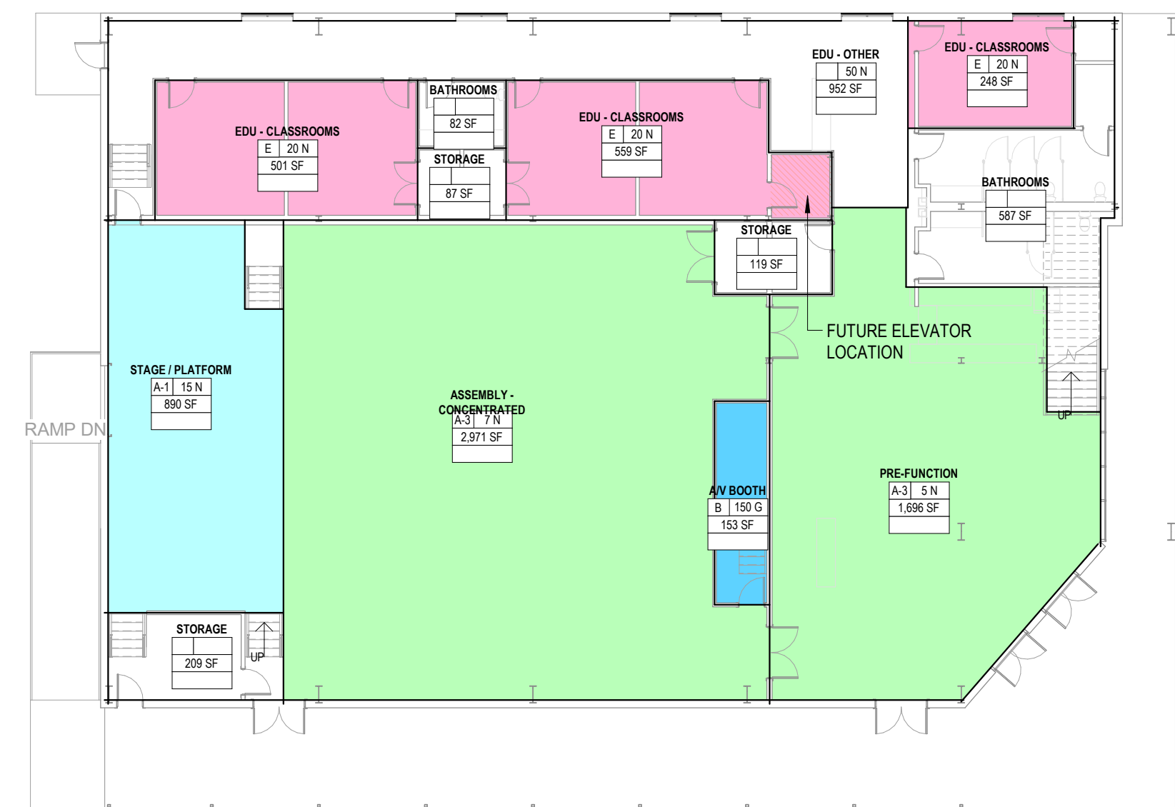
1 LIFE SAFETY AREAS - LVL 1 1/8" = 1'-0"